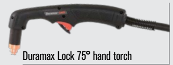
Duramax Lock 75° hand torch

(for more torch options, see www.hypertherm.com )