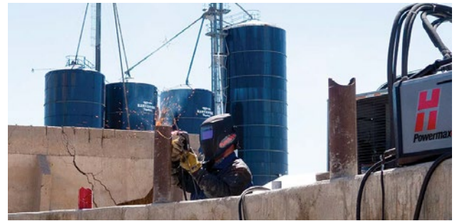
Agricultural and farm equipment maintenance