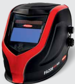
Fazor 1000 PLUS

/ ORDER NOW AND GET A FREE WELDING HELMET AND FREE SHIPPING WITHIN THE USA!